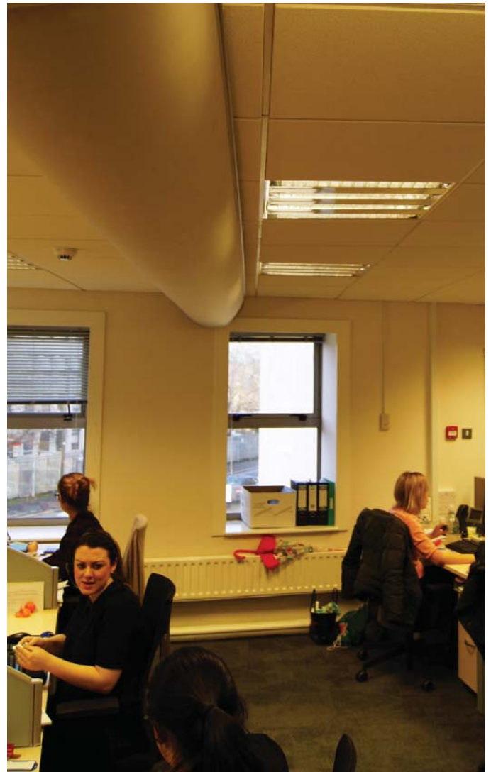
Flame Retardant and Cleanroom non fibre shedding