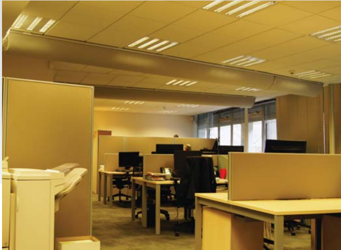
Light Grey Half Round Fabric Ducts