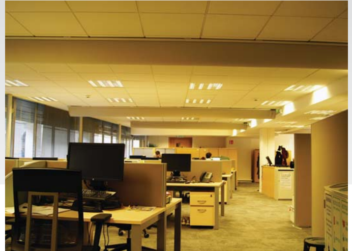
Mounted over desks velocity is minimal