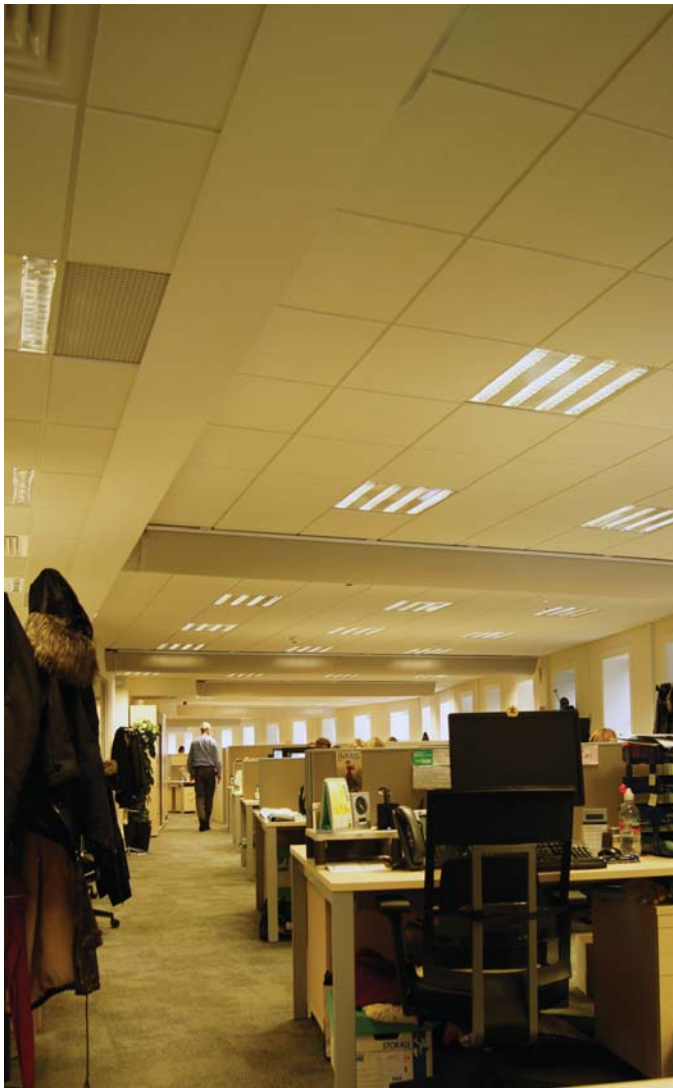
100% Post Consumer Recycled Materail Fabric Ducts