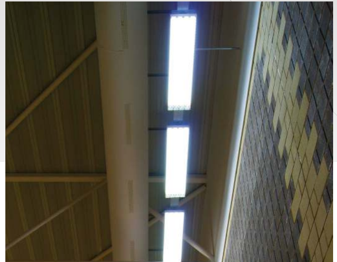
Laser Cut Perforations against a Sports Hall wall

It's important to choose the correct material whenever one uses a Fabric Duct. Here we would recommend a non-permeable material so that the supply air is being delivered solely through the nozzles or laser cut perforations. The use of a permeable material - where a proportion of the air exits through the weave of the material - is only really needed if the design calls for air to be delivered below dew point - as the permeable material stops the duct suffering from condensation. You can also choose between PVC coated material or plain woven. We generally recommend the plain woven material as its easy to clean in a washing machine and has a matt finish, not reflecting the lights in the Sports Hall.