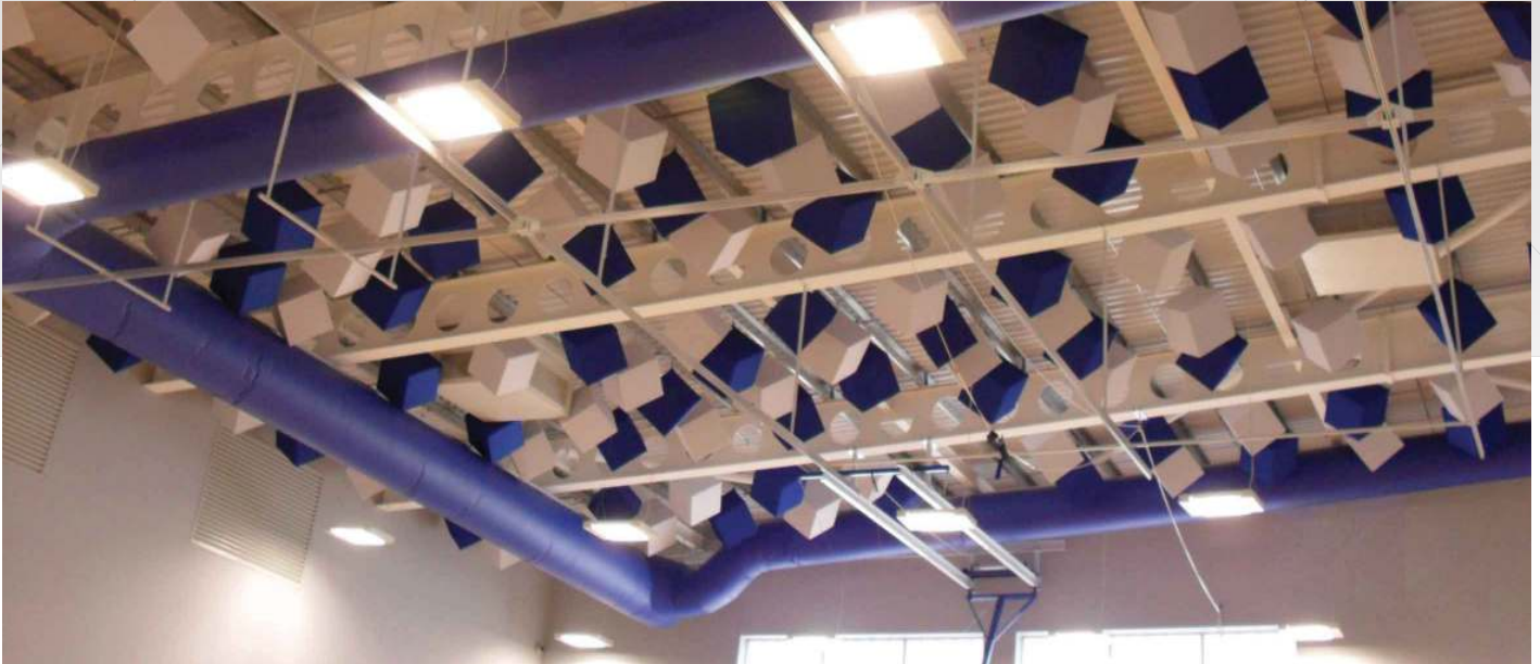
Whitmore School Sports Hall Prihoda Fabric Ducting