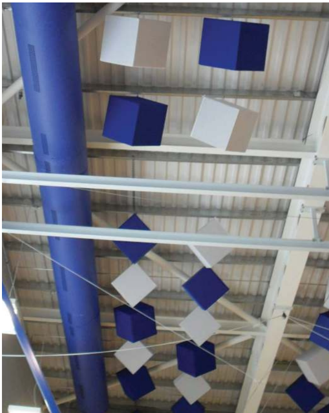
Whitmore School Sports Hall showing the different outlet diffuser style used along the walls to entrain more room air