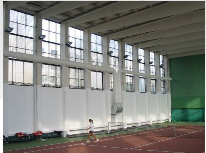
Fabric Ducting along the wall only - see why below...