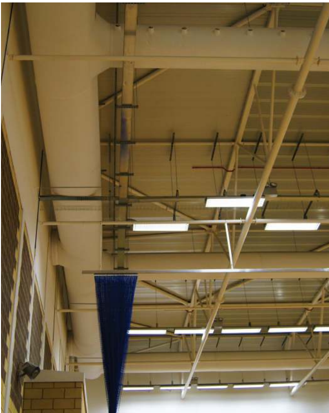
Plenum Distribution and branches all in Fabric showing Fabric Nozzles in the centre branch