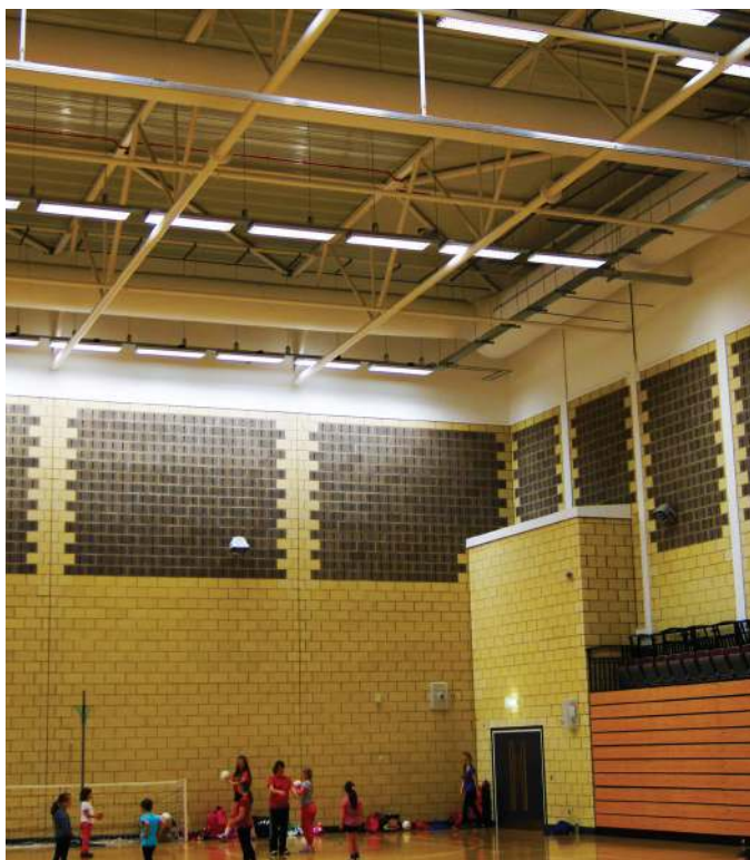
Ebbw Vale Sports Hall