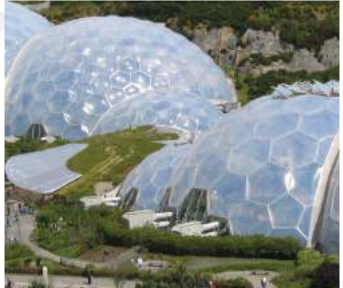
Eden Project - Cornwall UK

The restaurant called for two distinct air patterns from each duct. From the front of each Fabric Duct the air exited large diameter laser cut perforations to jet into the seating area, whilst inducing large volumes of ambient air to mix and slow the velocity once in the occupied zone. From the back of the duct a similar approach would have been too draughty for serving staff. Here we used blocks of 0.4mm microperforations allowing large volumes of air to exit very small diameter laser cut perforations, the air focussed into a specified direction, providing a high air volume but at an incredibly low velocity - providing cool, fresh air right into the serving environment.