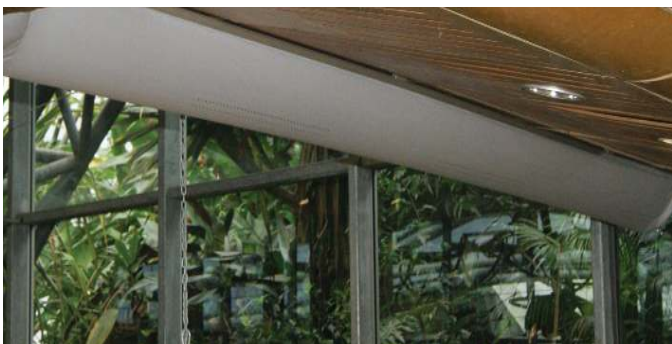
The restaurant links two different BIO DOMES