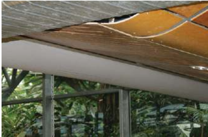
Flat Oval rigid duct converts to Fabric Half Round