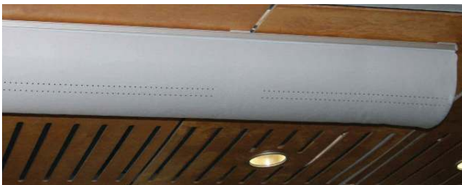
Laser cut Perforations directed towards seating areas