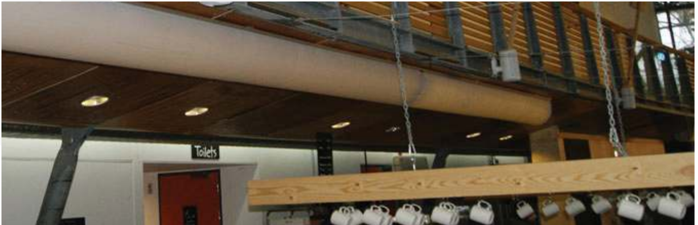
Kitchen Area with LED Lighting INSIDE the Fabric Duct